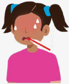
FEVER (temperature of 37.8°C or greater)