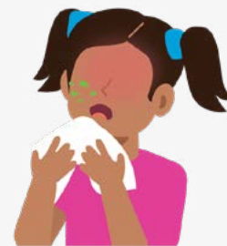
RUNNY NOSE, OR NASAL CONGESTION (unrelated to seasonal allergies, post nasal drip etc.)