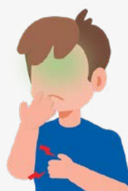
NAUSEA/VOMITING, DIARRHEA, ABDOMINAL PAIN